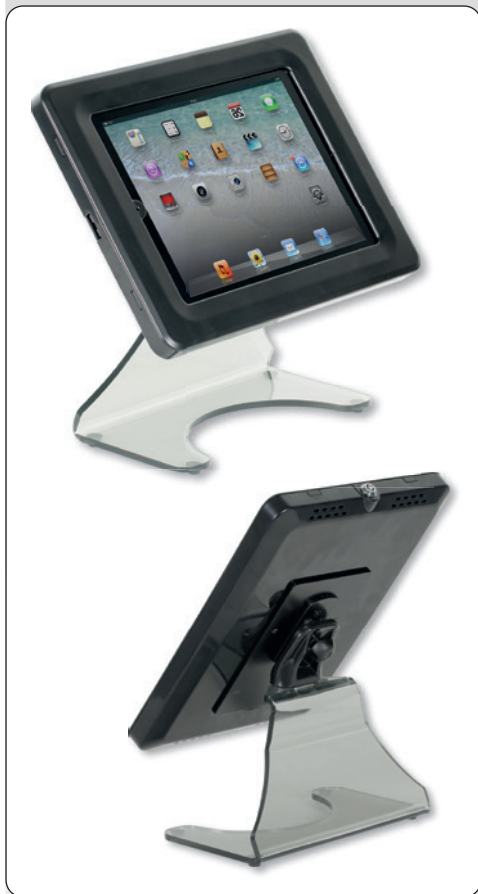
Table Holder for iPad/Tablet